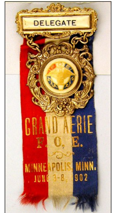
FOE Grand Aerie 1902 Delegate Badge