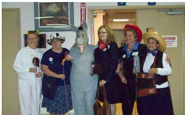
The Ladies of the New York Auxiliary after the Saturday afternoon skit.